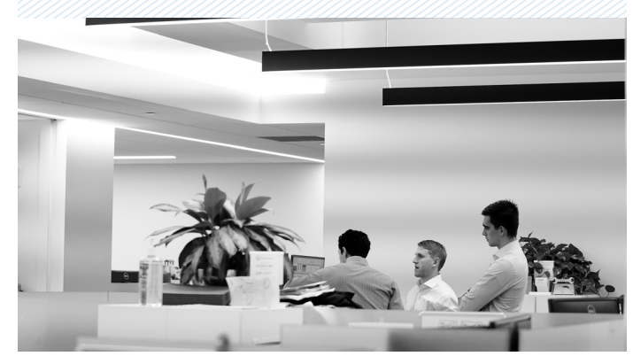
Inside views from NY offices