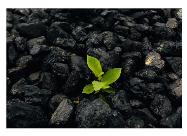
Biochar can improve soil's nutrient binding and water retention capacity and adds to the soil's porosity.

A lightweight black residue comprised of carbon and ashes that remains after the controlled pyrolysis (controlled burning) of biomass (e.g., wood) at a high temperature. Biochar is rich in carbon and can store it in the soil for thousands of years.