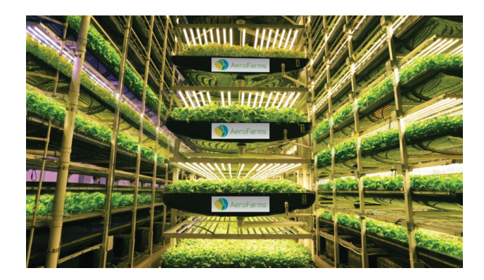
Image depicts a vertical farm designed and operated by AeroFarms to grow microgreens.

Type of agriculture that includes indoor farming (greenhouses) and vertical farming, with a technology-based approach to food production. CEAs aim to provide protection from the outdoor elements and maintain optimal growing conditions year-round throughout the development of the crop.