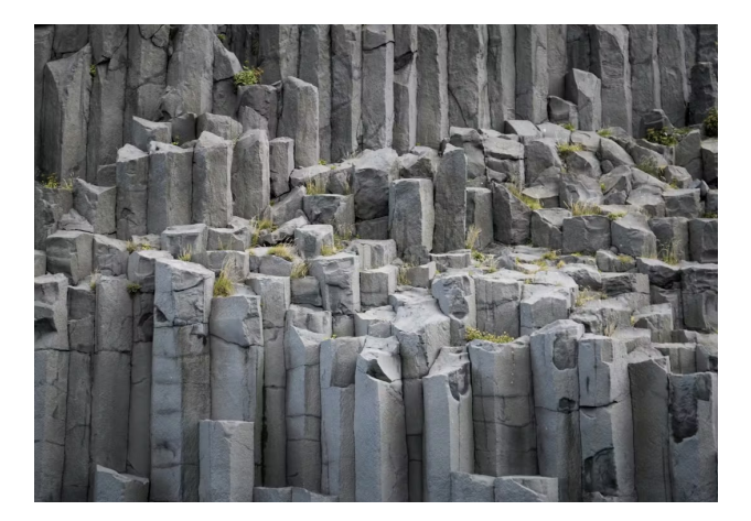
Image depicts basalt columns which are typically used as a form of enhance rock weathering. The basalt can be ground into a fine powder, increasing the surface area and therefore the rate at which weathering can occur. The powder is often then spread on agricultural land, where it contributes to soil health – or it can also be spread on beaches where it enters the ocean quickly.

A method of CDR which deliberately increases the rate by which certain rocks, such as basalt, peridotite, or olivine, break down to stimulate chemical reactions that cause the minerals to bond with \text{CO}_2 to form new stable carbonate minerals, effectively sequestering carbon in solid form. Selected rocks are crushed and ground into fine particles to increase their surface area and applied to terrestrial or marine environments where the particles can come into contact with \text{CO}_2 and water. This process is also known as accelerated weathering or mineral carbonation.