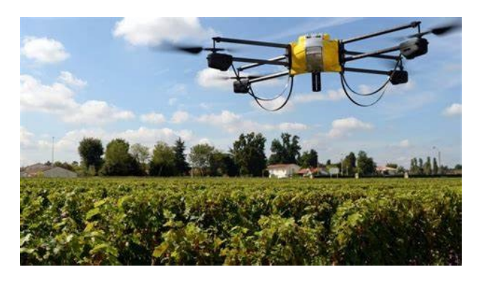
Image depicts a farm utilizing drones for fumigation.

Farming management strategy that involves observing and responding to spatial and temporal variability to enhance agricultural production. This strategy aims to improve productivity and conserve natural resources.