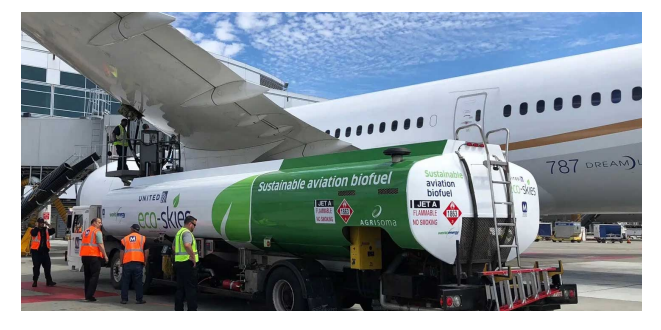
Image depicts a plane at San Francisco International Airport being fueled with Sustainable Aviation Fuel.

Alternative type of fuel made from non-petroleum feedstocks (renewable biomass) that reduce emissions from air transportation. Types of feedstocks include corn grain, algae, oil seeds, and other fats, oils, and greases.