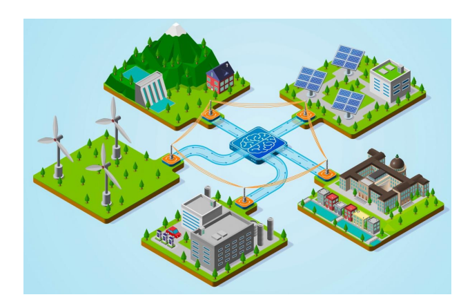
Grid optimization relies on data analytics, automation, and control systems to address challenges like power outages and renewable energy integration

Deployment and management of solutions and practices aimed at enhancing the efficiency, reliability, resilience, and sustainability of power distribution systems. Grid optimization leverages advanced technologies, data analytics, automation, and control systems to address challenges, such as grid congestion, voltage fluctuations, power outages, renewable energy integration and demand variability. Solutions include the deployment of smart meters and sensors throughout the grid to monitor energy consumption, detect grid faults, and optimize load balancing; the integration of intelligent devices (such as smart switches, reclosers, and sensors) into the distribution network to enable automated monitoring of power flows; and the utilization of advanced analytics and predictive modeling techniques to analyze grid data, forecast demand, detect anomalies, and optimize grid operations in real time.