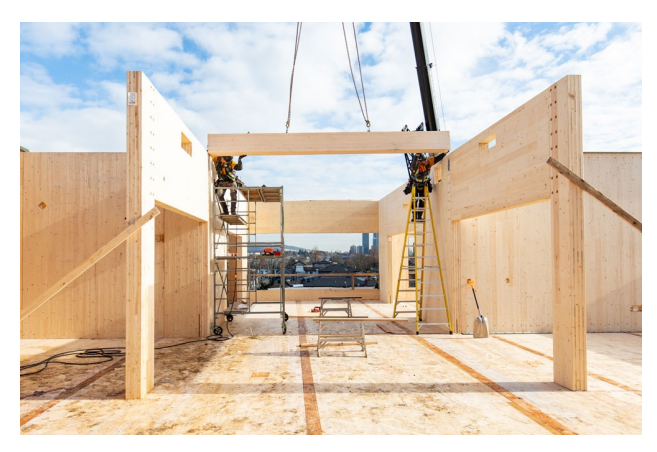
Image depicts a building being constructed using mass timber.

Construction, renovation, demolition, and maintenance of a building that prioritizes sustainability, energy efficiency, and social responsibility. According to the World Economic Forum, construction and buildings account for nearly 40% of global emissions. Cement production accounts for approximately 8% of anthropogenic global emissions, and steel production accounts for nearly 7% of anthropogenic global emissions. Green concrete and green steel are both sustainable alternatives to their traditional counterparts, aimed at reducing environmental impact. Another substitute is mass timber – a category of wood products that are fabricated from solid wood panels or boards, typically in large dimensions, for use in construction with high strength, stability, and durability. Mass timber is renewable, biodegradable, and has a lower carbon footprint compared to concrete and steel.