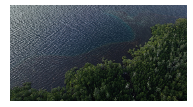
Image depicts mangroves along Wallace's Passage in Papua Guinea, Indonesia. Mangroves, along with seagrasses and slat marshes, are examples of blue carbon ecosystems that act as a natural carbon sinks.

Type of Climate Solution that aims to conserve and restore coastal and marine ecosystems (e.g., mangroves, seagrasses, and salt marshes), which are highly efficient at sequestering and storing carbon dioxide from the atmosphere. Blue carbon solutions offer multiple benefits beyond carbon sequestration, including supporting coastal livelihoods, protecting biodiversity, enhancing water quality, and reducing the risk of natural disasters.