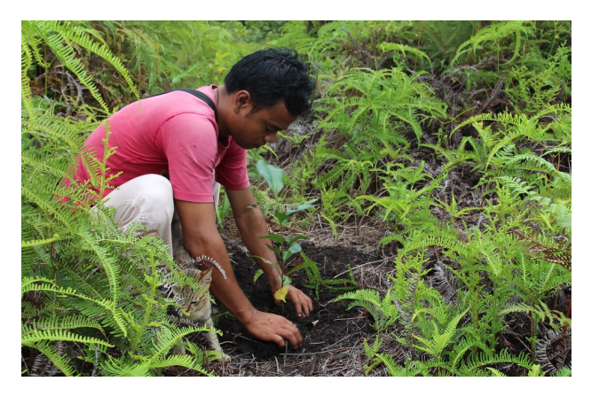
Image depicts the Pesalat Reforestation Project located in Indonesia where thousands of seedlings have been planted to restore forests lost due to fire and logging.

Afforestation creates new forests on previously non-forested land (e.g., agricultural fields) while Reforestation restores degraded forests or deforested land (e.g., areas destroyed by wildfires or poor management) to their original forested condition. Both approaches are important components of forest conservation, biodiversity and climate change mitigation strategies given forests' critical role as natural carbon sinks.