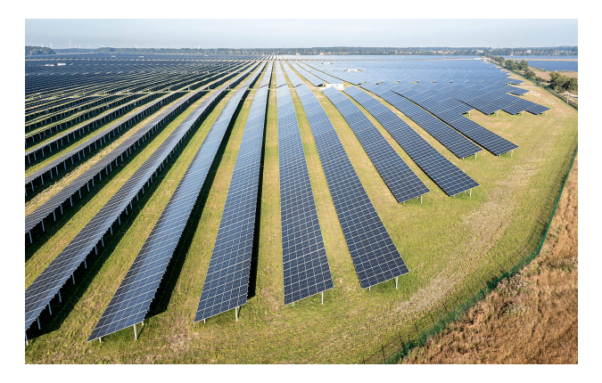
Image depicts EnBW Solarpark Weesow-Willmersdorf, Germany's largest solar park without state funding with 187 MW.

Device that converts energy from sunlight into electricity. Photovoltaic cells, also known as "solar cells", use materials with high conversion efficiency like silicon.