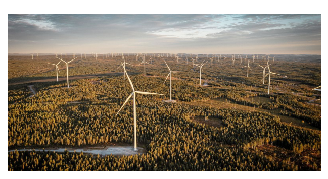
Image depicts Markbygden 1101, Europe's largest on-shore wind farm located in northern Sweden with 1.12 GW.

Energy derived from naturally replenished resources including solar, wind, hydropower, biofuel, ocean, hydrogen and geothermal. Non-renewable energy, in contrast, comes from finite sources, such as coal, natural gas, and oil. The primary challenge with renewables is intermittency: solar power depends on sunlight, wind on wind speed, and hydroelectricity on rainfall and drought – leading to fluctuations in energy supply and requiring backup power or energy storage. In addition, projects require significant land, and may require substantial investment in new infrastructure and supporting infrastructure such as transmission lines.