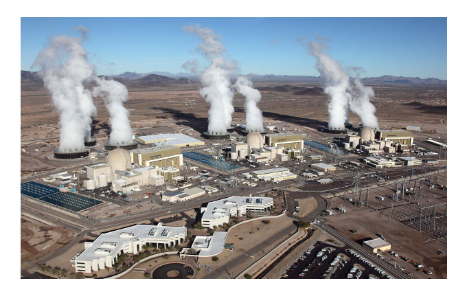
Image depicts the Palo Verde Nuclear Generating Station – one of the United States' largest power producers for nearly 30 years – all of it clean and carbonfree. The plant is a critical asset to the Southwest US, generating more than 32 million megawatt-hours annually – enough power for more than 4 million homes and businesses.

Nuclear power uses nuclear fission (where the nucleus of a heavy atom is split into two smaller nuclei) to release a large amount of energy in the form of heat. That heat is used to heat water and produce steam which drives turbines connected to generators, converting the kinetic energy of the spinning turbines into electricity. Although nuclear power plants do not emit greenhouse gases, they pose several challenges including the production of radioactive waste, safety concerns, and potential proliferation of materials used for weapons development. Large scale nuclear power plants are capital intensive and have long construction times, making them susceptible to cost overruns and delays. Small Modular Reactors (SMRs) are a class of nuclear power designed to generate electricity on a smaller scale compared to traditional large-scale nuclear power plants. SMRs are designed with simplified, modular components that can be manufactured off-site and transported to the reactor site for assembly allowing them to be deployed in a wider range of locations, including remote or off-grid areas, industrial facilities, and microgrid applications.